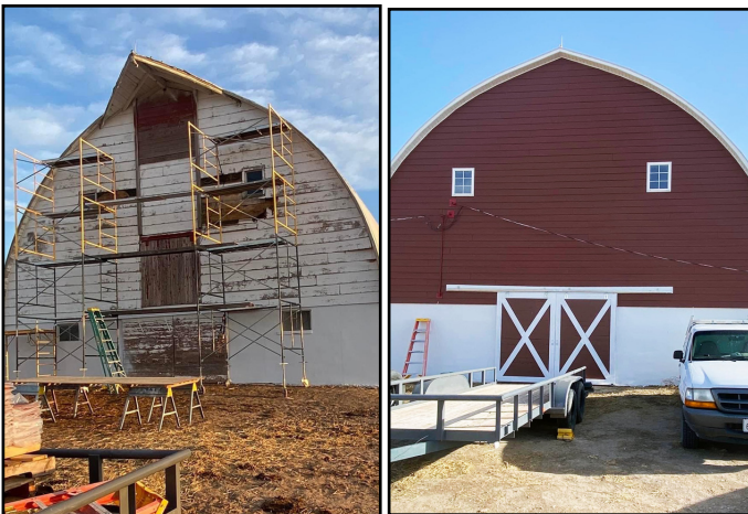
A barn in Burlington, Colo. gets a huge facelift.