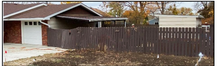
Before and after of a Chadron residential fence redo.

Helping members use electricity safety, that’s the power of your co-op membership. Learn more from the experts themselves at TogetherWeSave.com