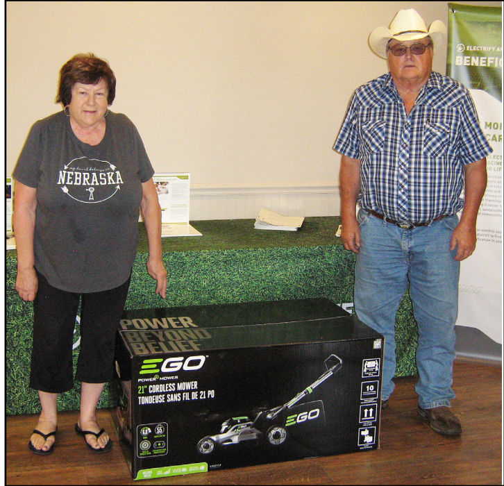
NORTHWEST RURAL PUBLIC POWER DISTRICT 5613 Hwy 87, Hay Springs