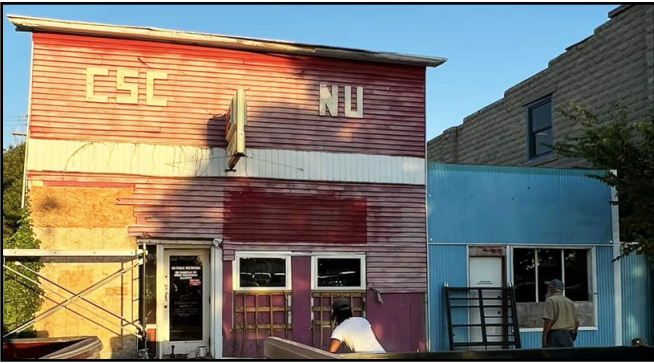
Dierksen Enterprises gave the Favorite Bar a facelift last fall. The new siding gave it a fresh new look.