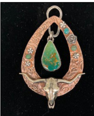
Copper Longhorn Charm