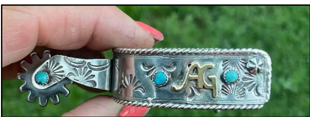
Spur Charm with Turquoise