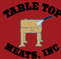
Table Top Meats

815 Box Butte P.O. Box 335 Hemingford, NE 69348