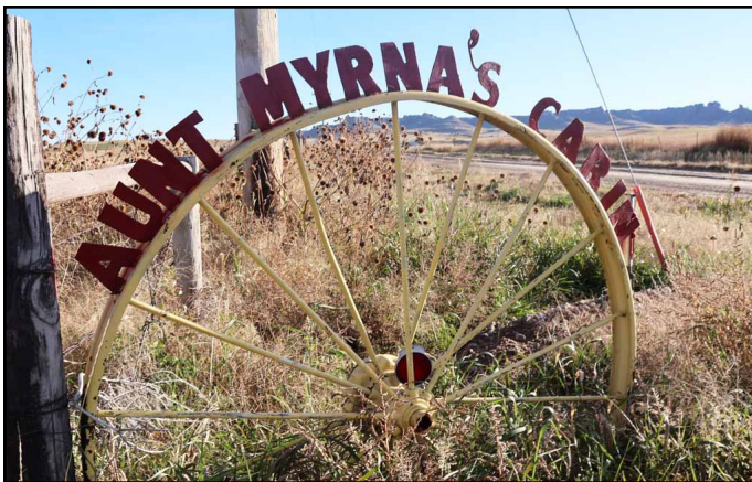
Note the Buttes in the background of Aunt Myrna's Cabin entrance gate south east of Crawford.

If you are interested in a print, you can contact Jim at jmm@millcomps.com or his website www.jimmphoto.com