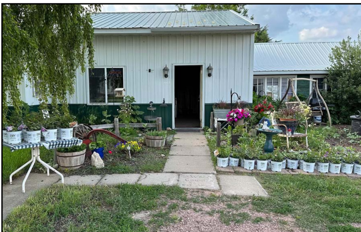
The main entrance into the greenhouse were dozens of plants are soaking up sun.

This time of year it's a wonderful warm humid place to