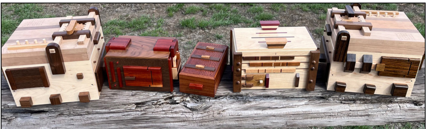
The five beautiful intricate wood puzzle boxes Ryan Hughbanks currently has offered online.