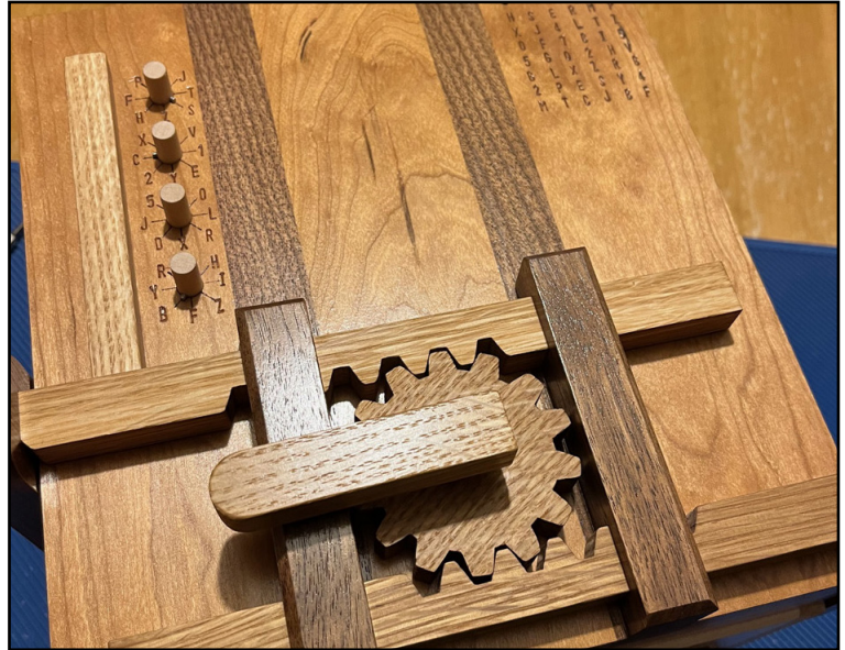
The top of this box shows some of the delicate detailing to crack open into the puzzle.

Hughbanks estimates he has constructed around 40-50 of the labor intensive puzzle boxes. "I only work on boxes in my spare time, mostly at night. Since I enjoy doing it and it is not my main source of income, I don't keep track of the hours it takes. For me, it's a fun hobby!," explained Hughbanks. "My CNC machine will greatly reduce the amount of time it takes once I