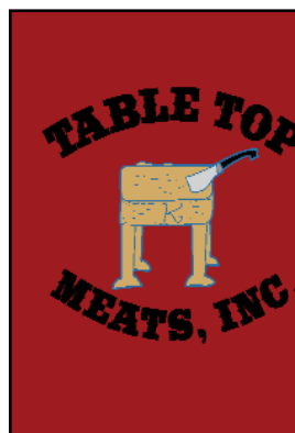
Table Top Meats

Securities & services offered through FBL Marketing Services, LLC+, 5400 University Ave., West Des Moines, IA 50266, 877/860-2904, Member SIPC. Farm Bureau Property & Casualty Insurance Company, ** Western Agricultural Insurance Company, ** Farm Bureau Life Insurance Company **/West Des Moines, IA. **Affiliates *Company providers of Farm Bureau Financial Services M191 (4-19)