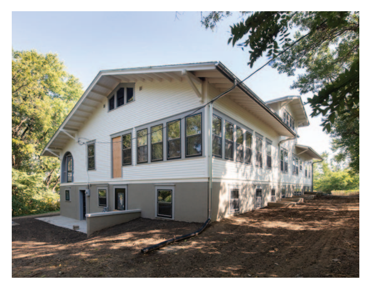
The building renovation project includes space for youth activities, a Native arts gallery and a gift shop.

Local residents purchased the building during a tax sale in 1992 with the hope of bringing it back to its original glory. Today, those involved in the restoration include the Nebraska Commission on Indian Affairs, the Omaha