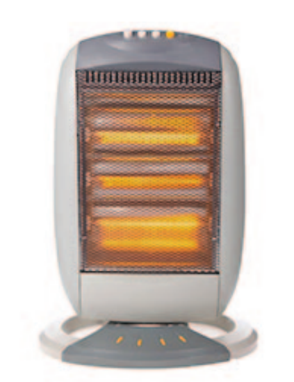
Space heaters have one purpose —to provide supplemental heating. Never use them to thaw pipes, cook food, or dry clothing or towels.

Metal coil and fan: Perhaps the most common and affordable type of space heater, this type uses electricity